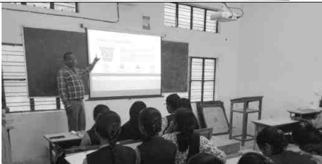
PRINCIPAL MOTHER TERESA COLLEGE OF PHARMACY NFC Nagar, Ghatkesar, Medchal Dist.